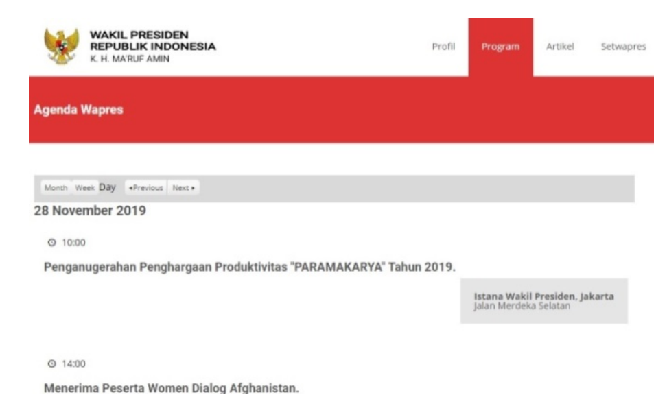
Figure 2. Screenshot of Indonesian Vice President's Website