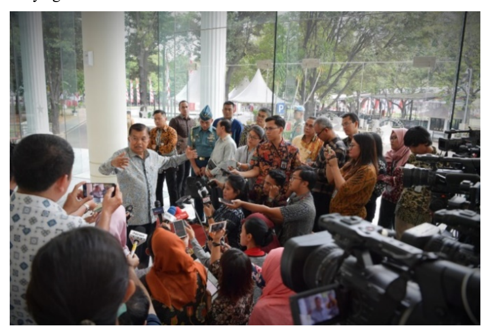
Figure 3. Coverage Activities / Doorstop Interview