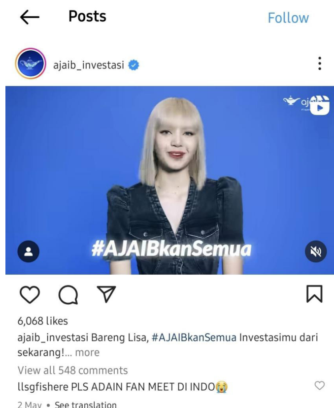
Figure 4 Lalisa Manoban (Black Pink Member) As Brand Ambassador for Magic Invest (Majaib)