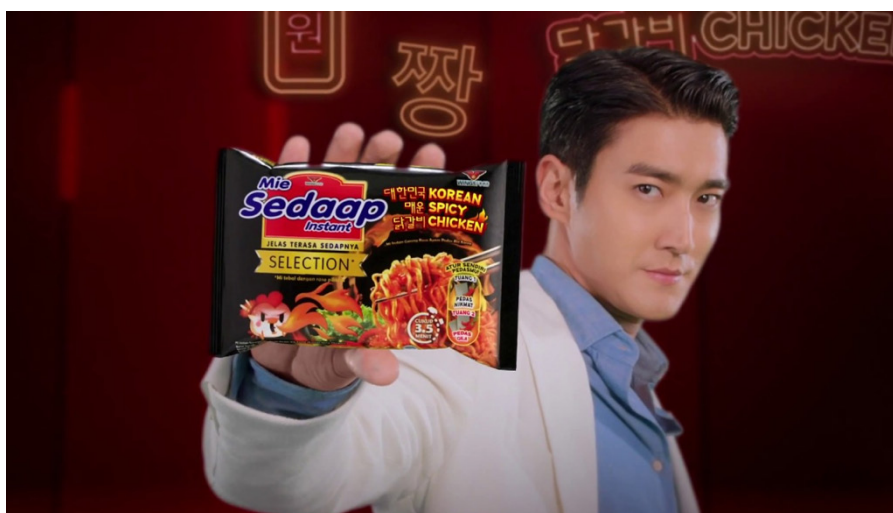
Picture 1 Mie Sedap Korean Spicy Variant with Brand Ambassador Choi Siwon