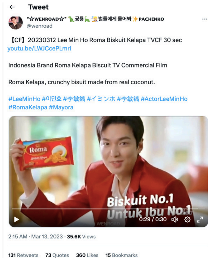
Figure 3 Netizen Responses on Social Media Twitter Roma Coconut Biscuits Ads

among women. Netizens, who are dominated by women, also responded to the Roma Kelapa biscuit advertisement that appeared on their social media homepage. As quoted from the tiktok account @minozann who commented “Mas usually eat biscuits with the family. Let’s have a family?” On one of the social media accounts, Twitter is also busy being discussed. for example, in one of the following accounts below.