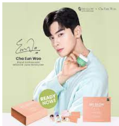
Figure 5 Cha Eun Woo as Brand Ambassador MS Glow

Attractiveness is a brand ambassador attribute that is considered attractive to arouse consumer interest in the brand or product it represents. In using celebrities, two important things are of concern for attractiveness, first, public or consumer sympathy (similarity) and similarity to the personality or image desired by brand or product users (similarity). When the two cannot be separated and must coexist. Brand ambassadors must reflect well on the brand personality that is built through advertising so that the message the company wants to convey can be done properly. In this case as a Brand Ambassador has a duty to have an appeal that can attract sympathy from the community and the extent to which the image that the company wants to convey to the public.