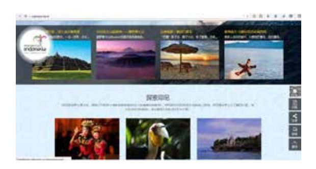
Figure 1 Wonderful Indonesia website in Mandarin

"In digital marketing promotion, we have a website in multiple languages which is dedicated for tourists of each country. This website is managed directly by staff of Indonesian ambassador in the representatives country. The contents also vary; starting from the latest news on Indonesian tourism to the tips and tricks for to holidaying Indonesia"