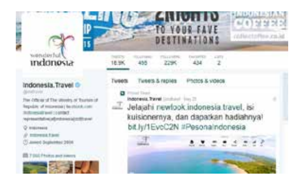
Figure 5 Wonderful Indonesia Twitter Account

In accordance with what Budihardjanti adressed, Branding Division is very active in following the development of digital marketing, because the market target - ie tourists at this time, are very fond of social media. To convey the message properly, social media accounts are beneficial to deliver persuasive message toward foreign tourists to visit Indonesia. It is also supported by Komang Ayu: