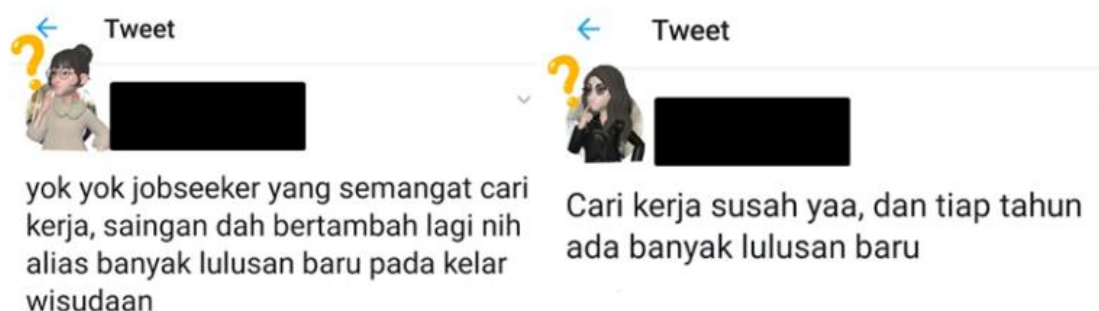
Figure. 1. fresh graduate Tweet for Job Seeker