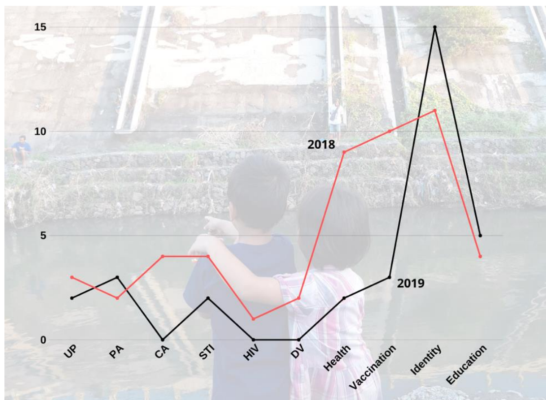
Figure 2. Cases increased of child assistance in street situations in 2018-2019 (source: Fian Hope Association annual report)

A survey conducted by the Harapan Fian Association shows that the problem of identity continues to rise among children in street situations. This happens along with the age development of children in street situations. In 2018, there were only seven cases of the absence of a child's identity in street situations. Then at the end of 2019 towards 2020, cases of no identity increased to 15 cases. The problem of child identity in street situations is due to the absence of a birth certificate, resulting in not knowing the date of birth and age of the child in street situations. In addition, some parents of children in street situations also do not have identity cards such as National Identity Cards and Family Certificates. Hence, the problem is then passed down to their children.