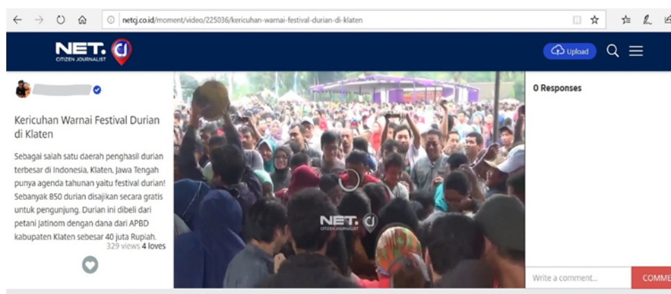
Figure 1. The screenshot of the example of inaccurate news

Another example is the news about the durian festival in Klaten entitled "The Chaos in Durian Festival in Klaten." However, both picture and voice showed no supporting facts regarding the chaos. On the contrary, many people made happy faces and were scrambling when the Durian was distributed. The other example of unbalanced news can be viewed in the news entitled "Because of Factory Waste, Students Wear Masks in the Classroom" that was posted in July 2017. This news clearly mentioned one of the factory names that was alleged as the cause of air pollution until it disturbed the teaching and learning activities, but it did not accommodate the confirmation of the related party.