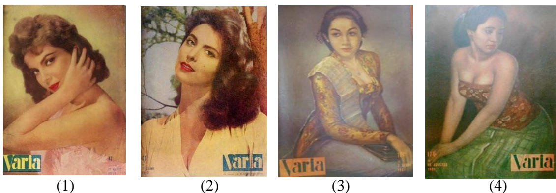
Figure 1, 2, 3, 4: Varia covers No 47/ March 1959, No 60/ June 1959, No 164/7 June 1961 and No 174/16 August 1961

Based on the observation towards entertainment magazine published around 1960 to 1961, Varia is one of the entertainment magazines that popularized Manipol-USDEK. This entertainment magazine produced national identity and anti-western elements in its covers. It can be seen from the change in the cover page of Varia before and after Manipol-USDEK spreaded in 1960. In the 1959 publications, this entertainment magazine still used western women on the cover page. However, after the instruction of Sukarno's political manifesto, Varia started to feature political themes associated with Sukarno's thought, local identity, culture and customs, traditional dances, and traditional costumes. Through traditional dress, for example, the political slogan manifested through the body of a woman with a traditional kebaya (Indonesian tradition costume) that presented on the cover page.