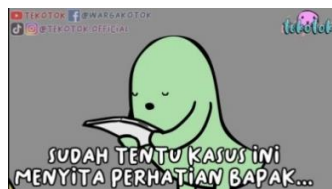
Frame 2 (00:21-00:25)