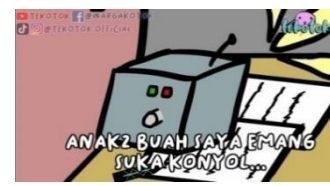
Frame 6 (01:02-01:22)