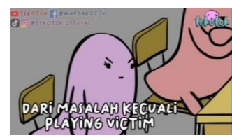
Frame 8 (01:39-01:59)