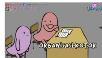
Frame 3 (00:26-00:39)