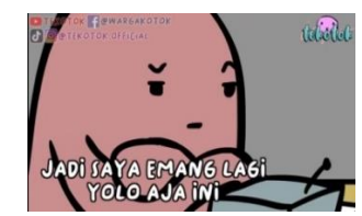
Frame 9 (02:02-02:15)