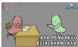
Frame 1 (00:08-00:20)

This study focuses on the signs in the Tekotok's Hones Translator Corruptor . The signs in question are dialogue, color, expression, and body language.