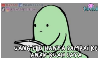
Frame 4 (00:40-00:46)