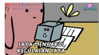
Frame 5 (00:54-00:58)