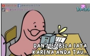
Frame 7 (01:26-01:37)