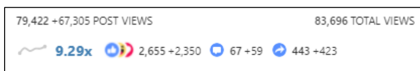
Figure 2. Reach Screenshot post on CrowdTangle Platform (CrowdTangle.com, 2021)

An example of influence from outside the organization is the collaboration with the Facebook Journalism Project, which facilitates third-party fact-checkers with dashboards and CrowdTangle tools that can be used to monitor viral content on social media. The CrowdTangle platform is also accompanied by a description of views, likes, comments, and shares owned by content. Therefore, the Tempo.co's Fact Check team can measure the virality of content through features as shown in Figure 1.